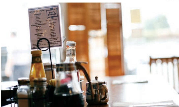
Pie 'n Burger

Lost at Sea is a newcomer to Pasadena's culinary scene, it is the result of a former fishmonger and a former sommelier coming together. While the ambiance at Lost at Sea feels much more chic than a Chart House, Chef Tim Carey's approach is decidedly classic and French rather than rustic. The restaurant's wine selection carries just as much weight as the food, Santos Uy—who was Silver Lake Wine's first employee and served as sommelier at AOC—assembled small production and natural wines.