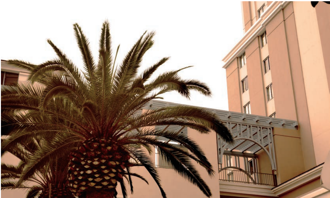
The Westin Pasadena

Comfort Inn 2462 E. Colorado Blvd. 626-405-0811 choicehotels.com Green Tree Pasadena Inn 400 S. Arroyo Pkwy. 626-795-8401 greentreepasadenainn.com Hotel Le Reve Pasadena 3321 E. Colorado Blvd. 626-796-9291 hotellerevepasadena.com