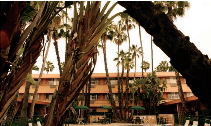
Courtyard pool at the Saga Motor Hotel

The Westin Pasadena With 350 guestrooms and 26,000 square feet of meeting space, The Westin Pasadena offers exceptional service, upscale amenities, and elements of comfort. Rejuvenate in a state-of-the-art workout facility, relax by the outdoor pool, or decompress in a Heavenly Bed®. Located in the heart of downtown. 191 N. Los Robles Ave. 626-792-2727 westin.com/pasadena