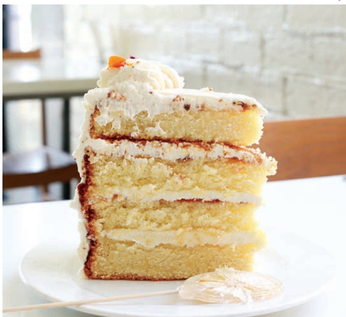
Lincoln's Citrus Buttercream Cake

An oldie but goody is 1960s institution Pie 'n Burger, a fun little diner with wood paneled walls and long, laminate lunch counter with colonial revival counter stools. People come from afar for their award-winning hamburger with cheese. Make sure to bring cash because they do not accept credit cards.