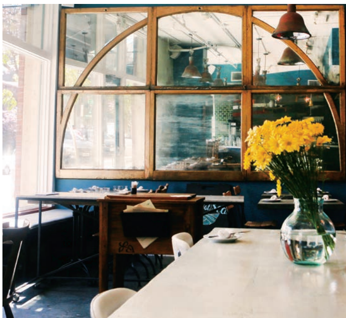
Lost at Sea

Lost at Sea is a newcomer to Pasadena's culinary scene, it is the result of a former fishmonger and a former sommelier coming together. While the ambiance at Lost at Sea feels much more chic than a Chart House, Chef Tim Carey's approach is decidedly classic and French rather than rustic. The restaurant's wine selection carries just as much weight as the food, Santos Uy—who was Silver Lake Wine's first employee and served as sommelier at AOC—assembled small production and natural wines.